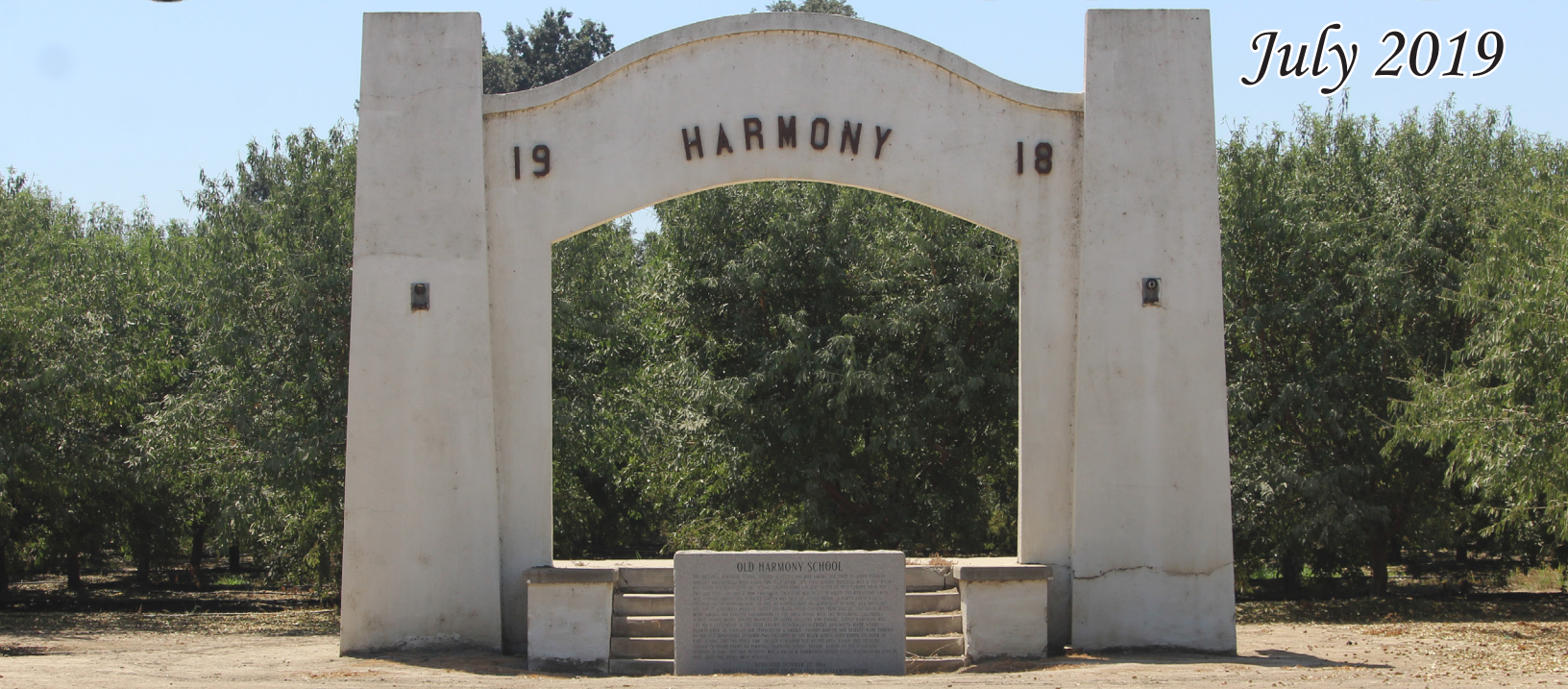
Old Harmony Schoolhouse, Porterville, CA Louie T